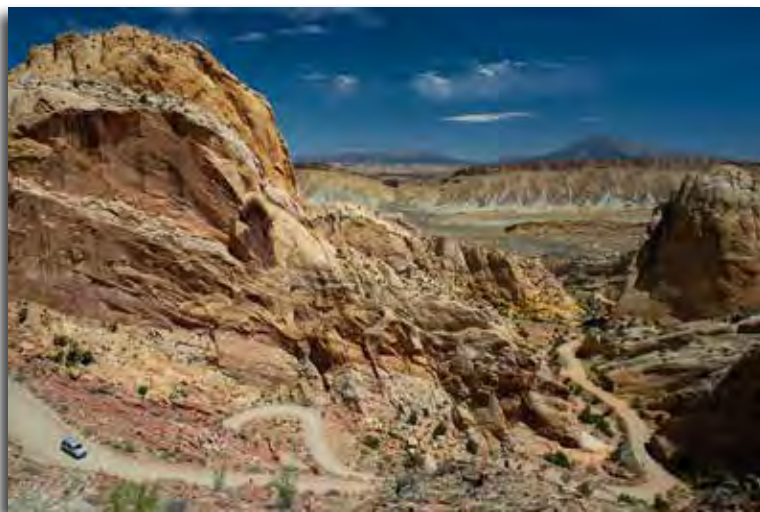
3 rd "Burr Trail" Sean Crawford