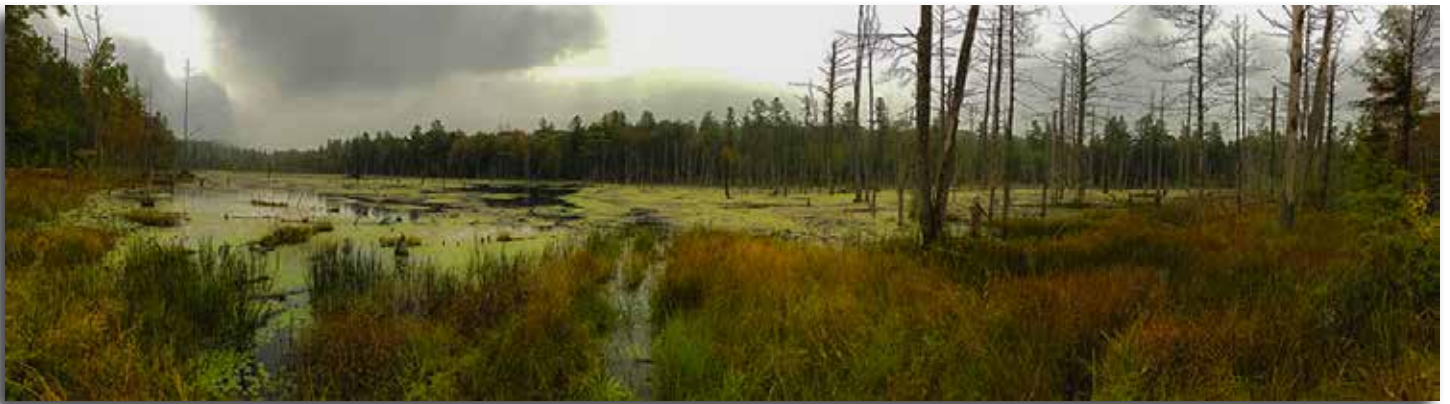
HM "Storm Clouds Over a Beaver Pond in Swanzey, New Hampshire" Carol Fuessenich