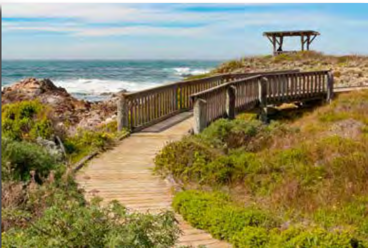
"Asilomar State Beach along Sunset Drive"

Rick summarized his fondness for Pebble Beach and adjacent areas accordingly, "The Monterey Peninsula juts out into the Pacific enough, compared to the general line of the California coast that, climate-wise, we may as well be on a ship at sea, which suits me just fine. One can literally spend days making photos of these areas and remake completely different ones from the same places at different times. I've been doing so for 20 years; it's a landscape photographer's dream."