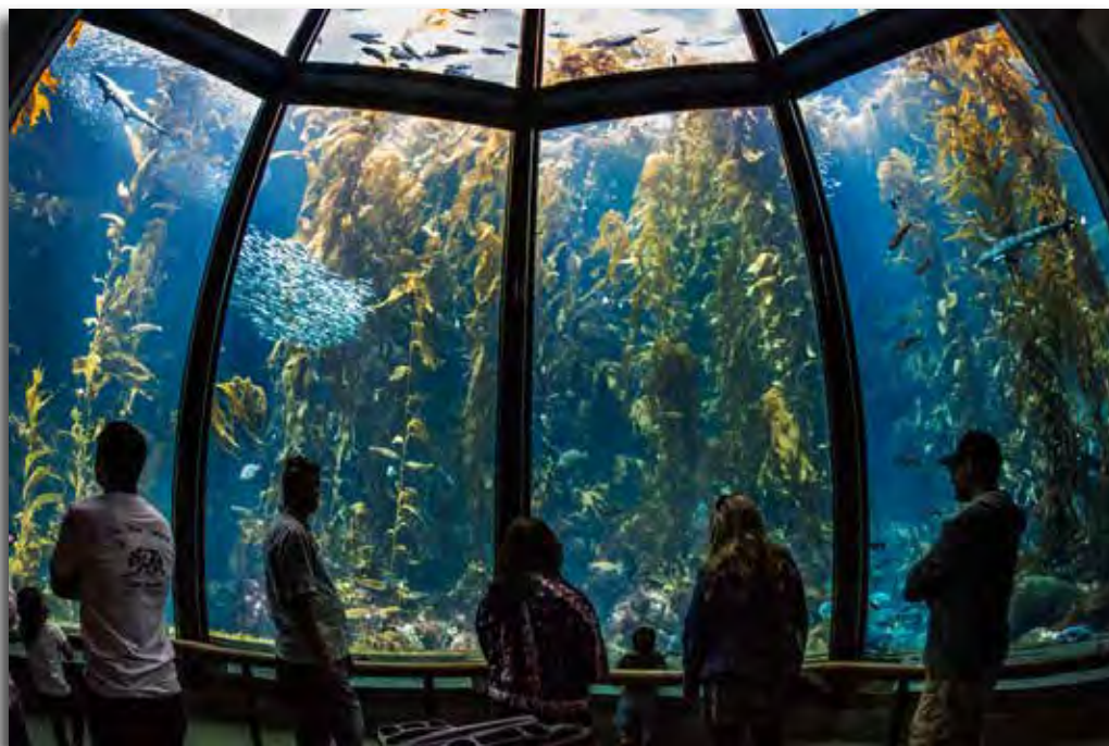
1 st "A Trip to the Monterey Bay Aquarium" Brian Spiegel