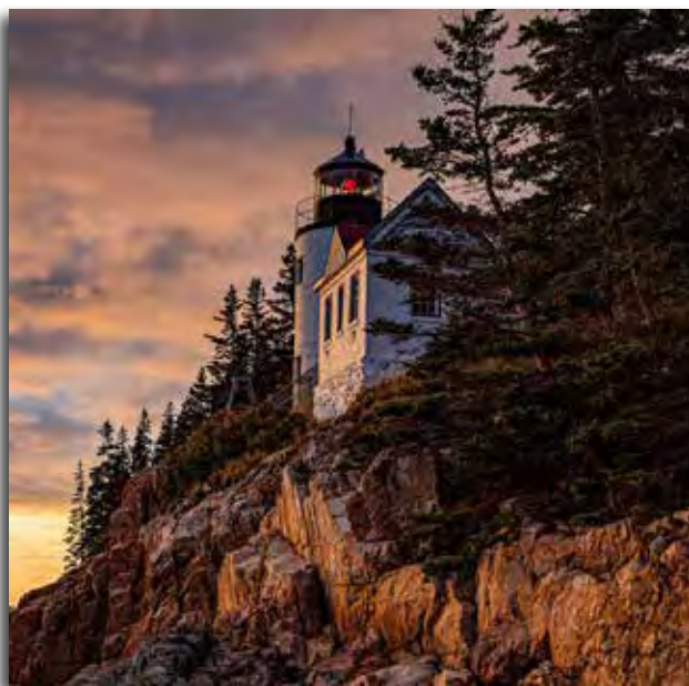
HM "Bodie Island Lighthouse, North Carolina" Bill Shewchuk