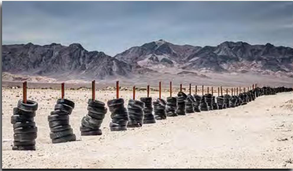
HM "Art in the Desert" Nicole Asselborn