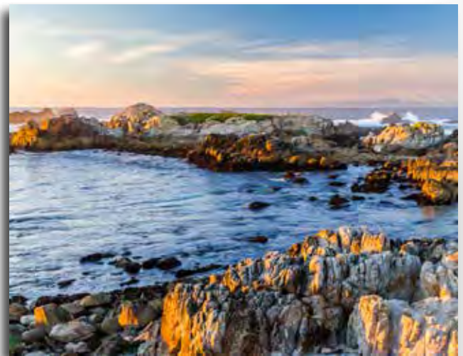
"Point Pinos at Asilomar"