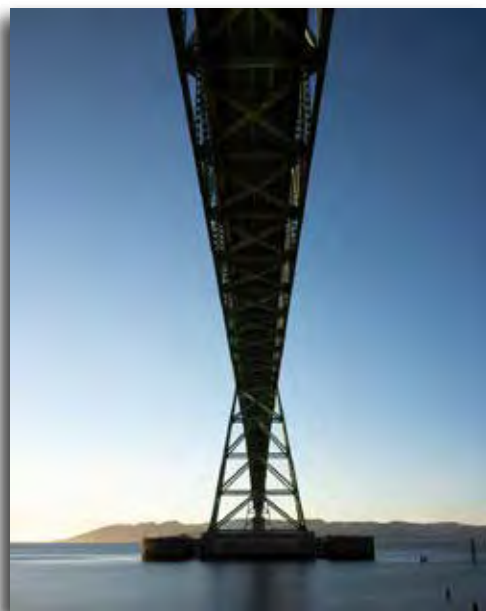
"Astoria Megler Bridge, Oregon"