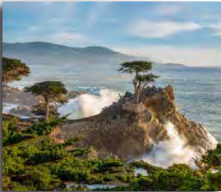
"The Lone Cypress"

Other places Rick likes to photograph inside Pebble Beach include the famous Lone Cypress tree along 17-Mile Drive and Stillwater Cove.