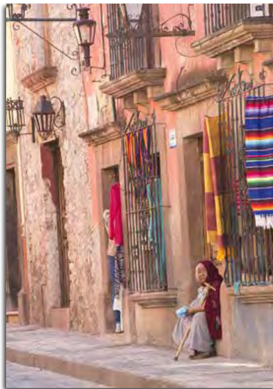
2 nd "Street in San Miguel de Allende, Mexico" Carol Silveira