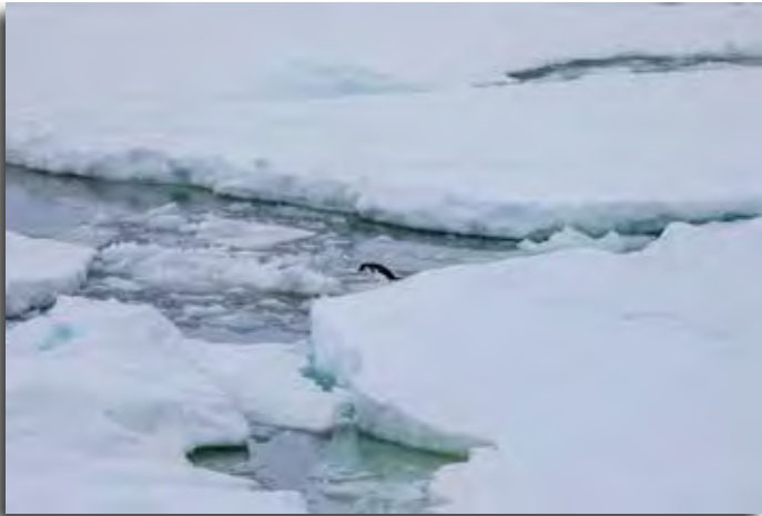
2 nd "Lonely Penguin" Dick Light