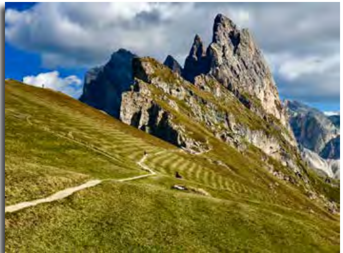
HM "Seceda, Dolomiti, Italia" Cath Tandler